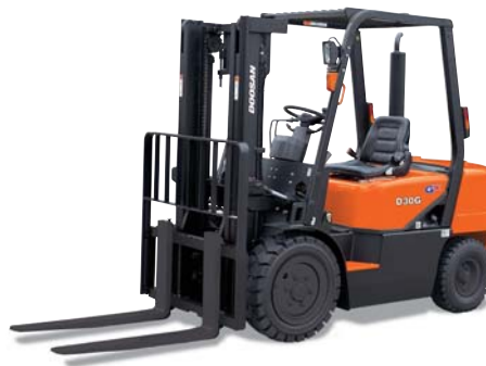
D20G / D25G / D30G 2,000kg 2,500kg 3,000kg Diesel, Pneumatic Tire