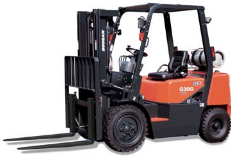
G20G / G25G / G30G 2,000kg 2,500kg 3,000kg Gas, LPG, Pneumatic Tire