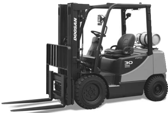
G20E / G25E / G30E-5 G20P / G25P / G30P / G33P-5 & G35C-5 2,000kg 2,500kg 3,000kg 3,300kg 3,500kg LP, Pneumatic Tire