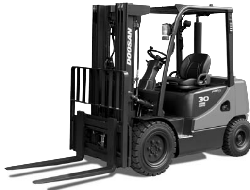
D20S / D25S / D30S / D33S-5 & D35C-5 2,000kg 2,500kg 3,000kg 3,300kg 3,500kg Diesel, Pneumatic Tire